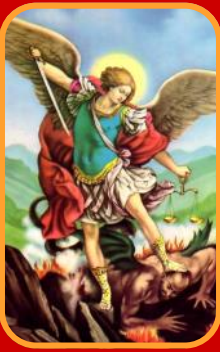
St Michael the Archangel, A Warrior for Today