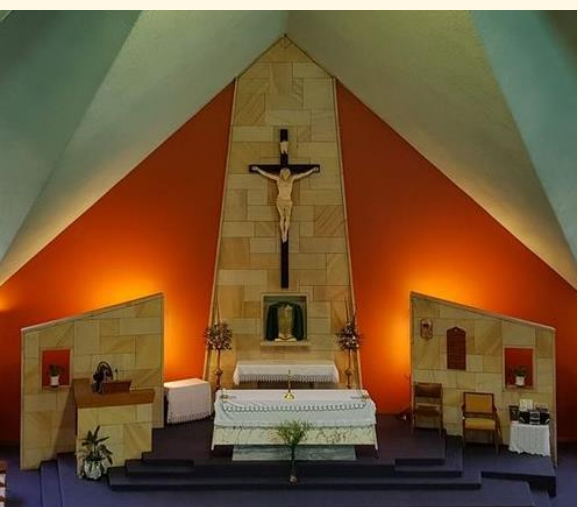
St Bernadette Carlton